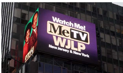
MeTV - WJLP